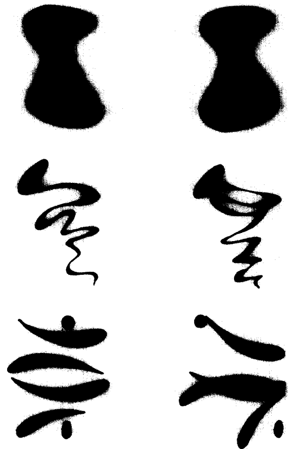
Figure 1. Easy, medium, and difficult items on the Visual Aesthetic Sensitivity Test.

judgment is that when groups of subjects are tested, the majority judgment always agrees with the keying of the items. This agreement between experts and unsophisticated members of the public is difficult to explain in terms other than some universal sense of aesthetic appreciation possessed in different degree by everybody—few scores below chance have been observed. Figure 1 shows three typical items from the test, ranging from easy through average to difficult . The difficulty level of items is established in terms of the percentage of right responses; the more subjects give the right answer, the easier the item. Different groups of subjects, differing in age, sex, artistic training, cultural