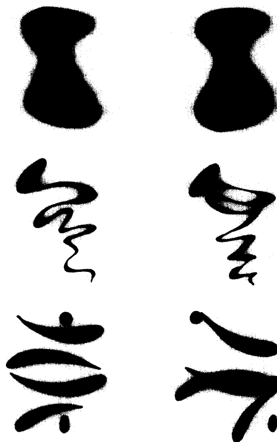
Figure 1. Easy, medium, and difficult items on the Visual Aesthetic Sensitivity Test.

judgment is that when groups of subjects are tested, the majority judgment always agrees with the keying of the items. This agreement between experts and unsophisticated members of the public is difficult to explain in terms other than some universal sense of aesthetic appreciation possessed in different degree by everybody—few scores below chance have been observed. Figure 1 shows three typical items from the test, ranging from easy through average to difficult . The difficulty level of items is established in terms of the percentage of right responses; the more subjects give the right answer, the easier the item. Different groups of subjects, differing in age, sex, artistic training, cultural